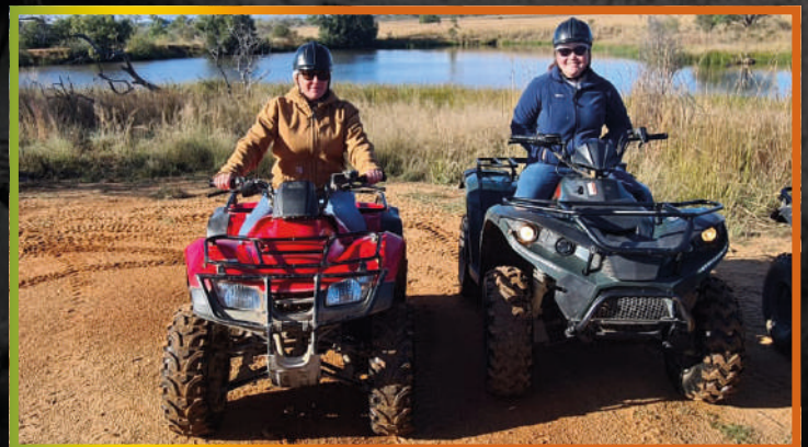
Quad Bike Safaris