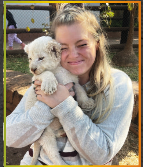
Cuddle a Lion Cub