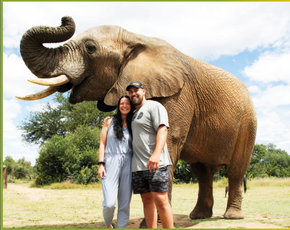
Hug an Elephant

Africa is certainly not only for the hunter. While the hunters are out in the field, non-hunters can relax at the lodge or go out on fully guided, spectacular sight seeing trips. Our full-time tour guide will take non-hunters out on exciting activities in the vicinity of the hunting area. After a full day of fun, they can reunite with the hunters and discuss the exciting events of the day around the blazing campfire underneath the starry African sky.