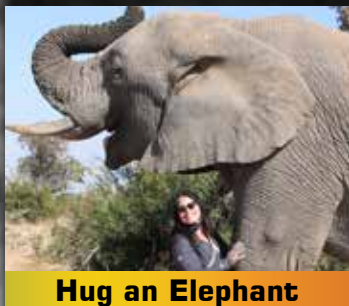
Hug an Elephant

BOTH OBSERVER OPTIONS INCLUDE AIRPORT TRANSFERS, ACCOMMODATION, CATERING AND BEVERAGES. COST OF ACTIVITIES IS NOT INCLUDED.