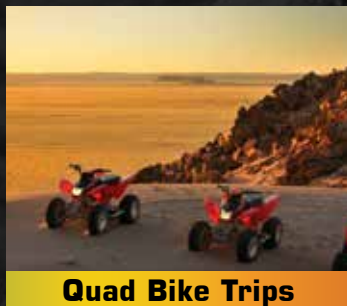
Quad Bike Trips